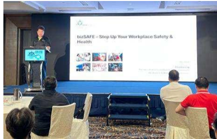
bizSAFE presentation at Pleasure Craft Safety Working Group Forum